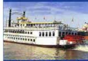
Enjoy a Riverboat Cruise