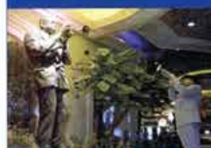
New Orleans - "Birthplace of Jazz"