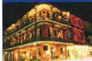
View the French Quarter