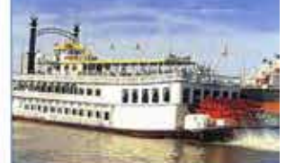
Enjoy a Riverboat Cruise