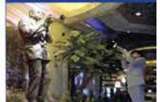
New Orleans - "Birthplace of Jazz"