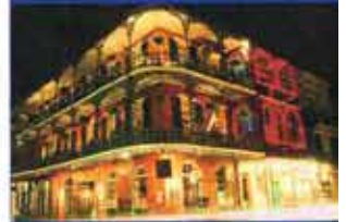
View the French Quarter