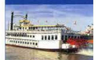
Enjoy a Riverboat Cruise