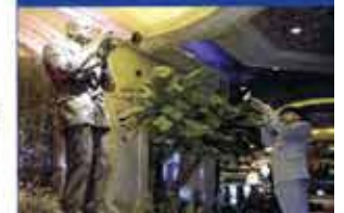
New Orleans - "Birthplace of Jazz"