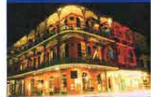
View the French Quarter