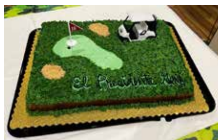
One of a pair of great cakes provided by Winn Dixie