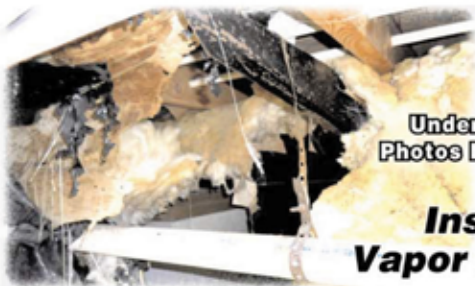
Underhome Photos Provided

Insulation Under Your Home Falling Down? Holes and Tears in Your Vapor /Moisture Barrier?